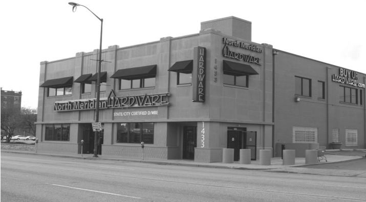
Above: North Meridian Hardware