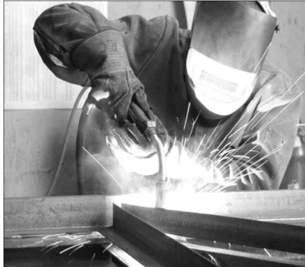
HG Metals Welder at Work