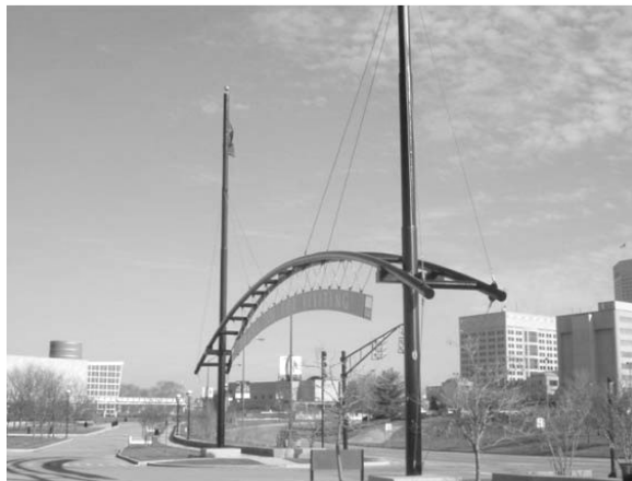
White River State Park Entrance

We wish the company continued success. They are now part of our successful alumni.