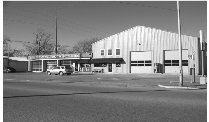
Above: Dartt Automotive